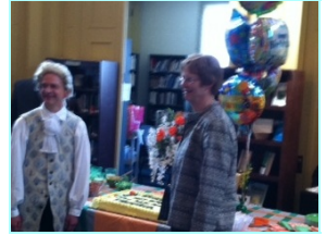
J S Bach at birthday party